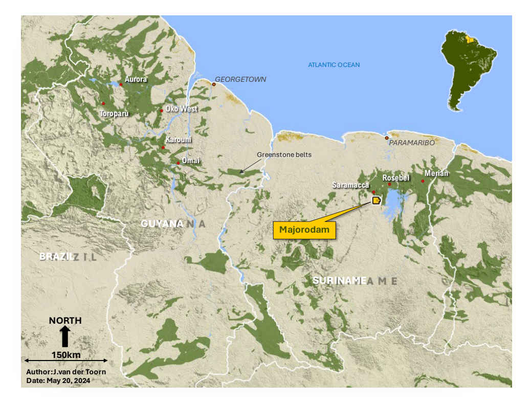
Accessibility, Climate, Local Resources, Infrastructure & Physiography

All permits are in place to conduct the recommended work program. In the authors opinion there is no significant factors and risks that may affect access, title, or the right or ability to perform work on the property.